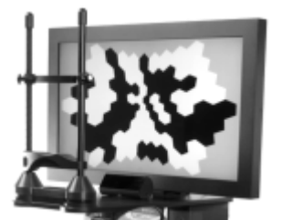
Headrest and testing Screen